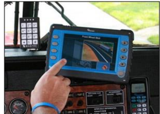
Electronic Driver Log